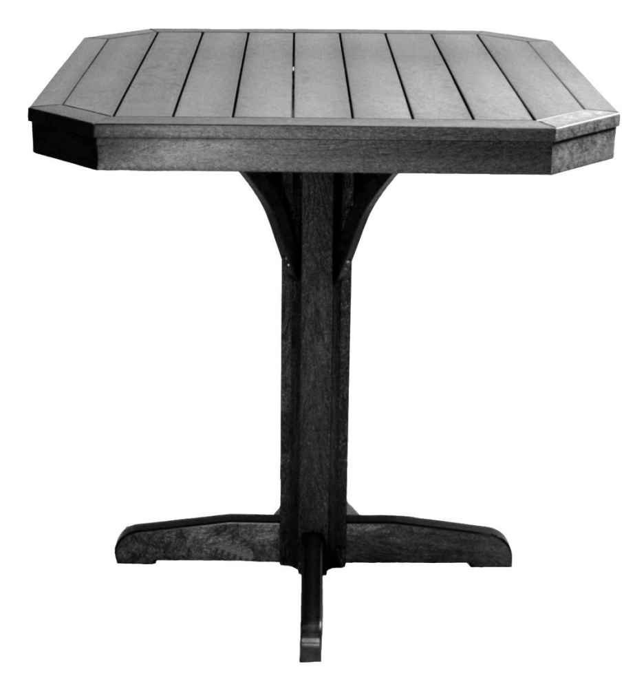
T37 St. Tropez 35" Square Counter Pedestal Table

C.R. Plastic Products Inc. 1 – 533 Romeo Street South Stratford Ontario N5A 4V3 Toll Free: 800-490-1283